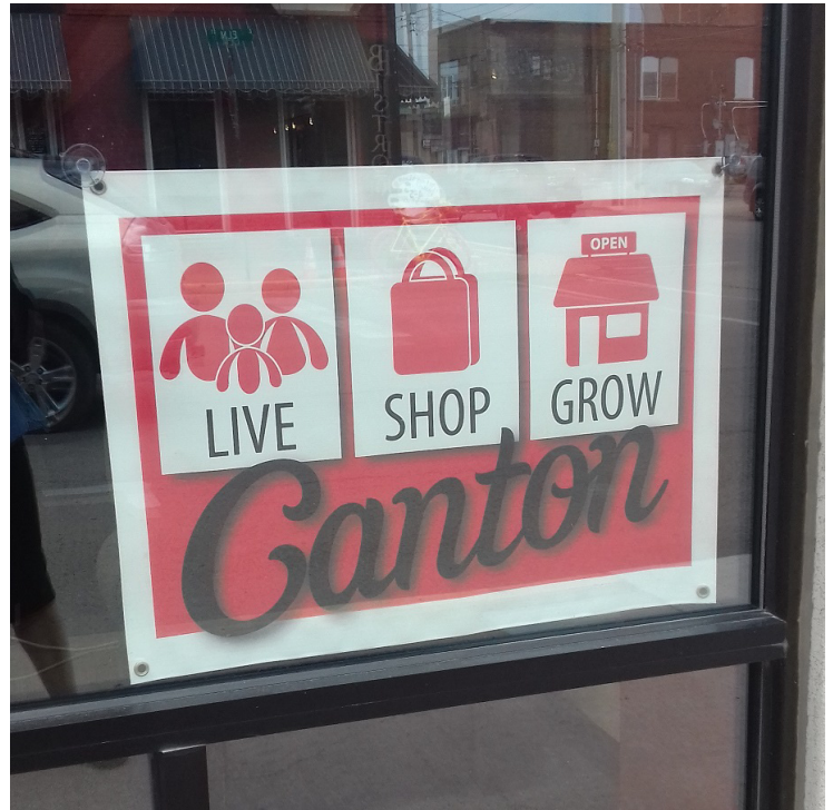
Canton "Buy Local" Campaign

Communication is the cornerstone of Canton's success, whether that be transparency of city programs and incentives for the community, dialogue with other communities in the county, or discussions between city entities. Clear communication ensures that resources are used efficiently and that nobody is left out of the loop. It prevents misunderstandings that lead to lost opportunities and contributes to the smooth functioning of all programs. Specific avenues and strategies for ensuring clear communication – whether it be public meetings, websites, social media, or listservs – help make the transmission of information easy and accessible.