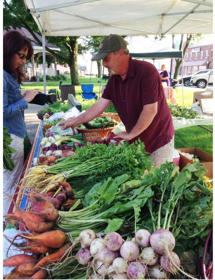
Canton Farmer's Market

Since relationships are strong between government and other organizational bodies, costs and resources can be shared across all groups. A willingness to collaborate means that while Public Works may be responsible for trash pick-up, if an event is planned for a particular day, volunteers can be recruited to pick up trash, allowing Public Works to devote their time to other functions. Individuals and groups contribute to Canton, and residents and city officials appreciate them as Canton's greatest assets. A sense of mutual investment and gratitude emanates from all that is happening in the downtown.