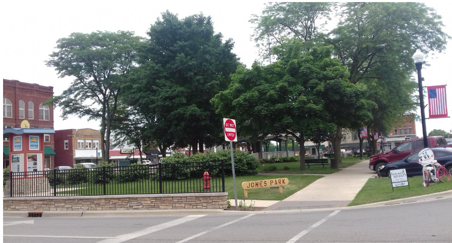
Jones Park Square in Downtown Canton