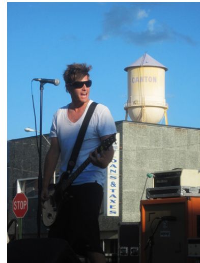
Music in the Park